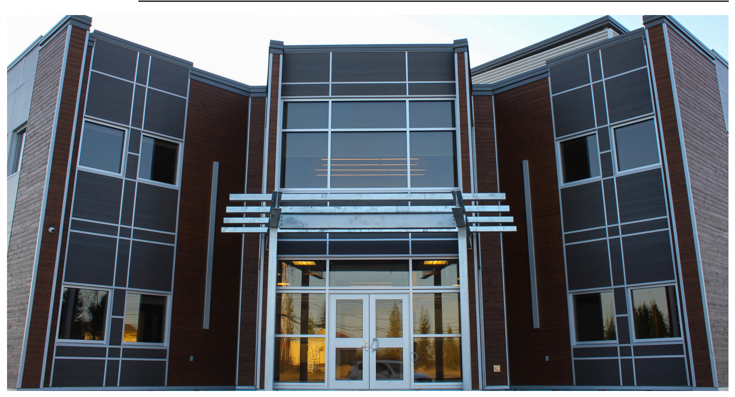
Front entrance of new TDC Administration Building