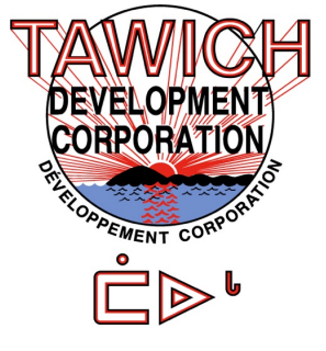
Tawich Development Corporation 12 Tawich Road Wemindji Qc JOM 1L0