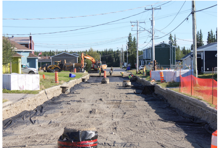
Tawich Construction - Aiming Higher Page 6