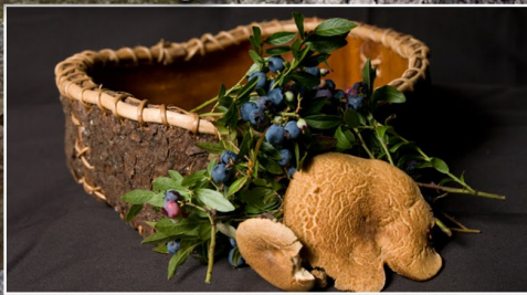
DESIGNED BY REZOUDE.CA

Wemindji 2016 package including 3★ ★ ★ hotel, community guided tour, canoe-kayak and cultural village