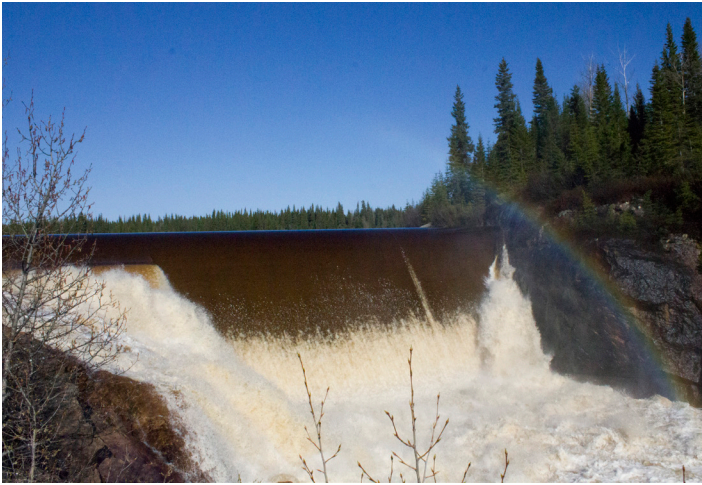
Continuing a Legacy - A look back on Tawich Development Page 4