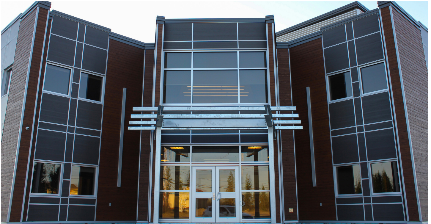
Front entrance of new TDC Administration Building