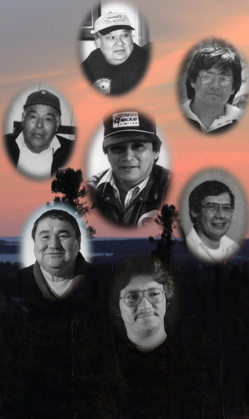
TAWICH DEVELOPMENT CORPORATION FOUNDING MEMBERS